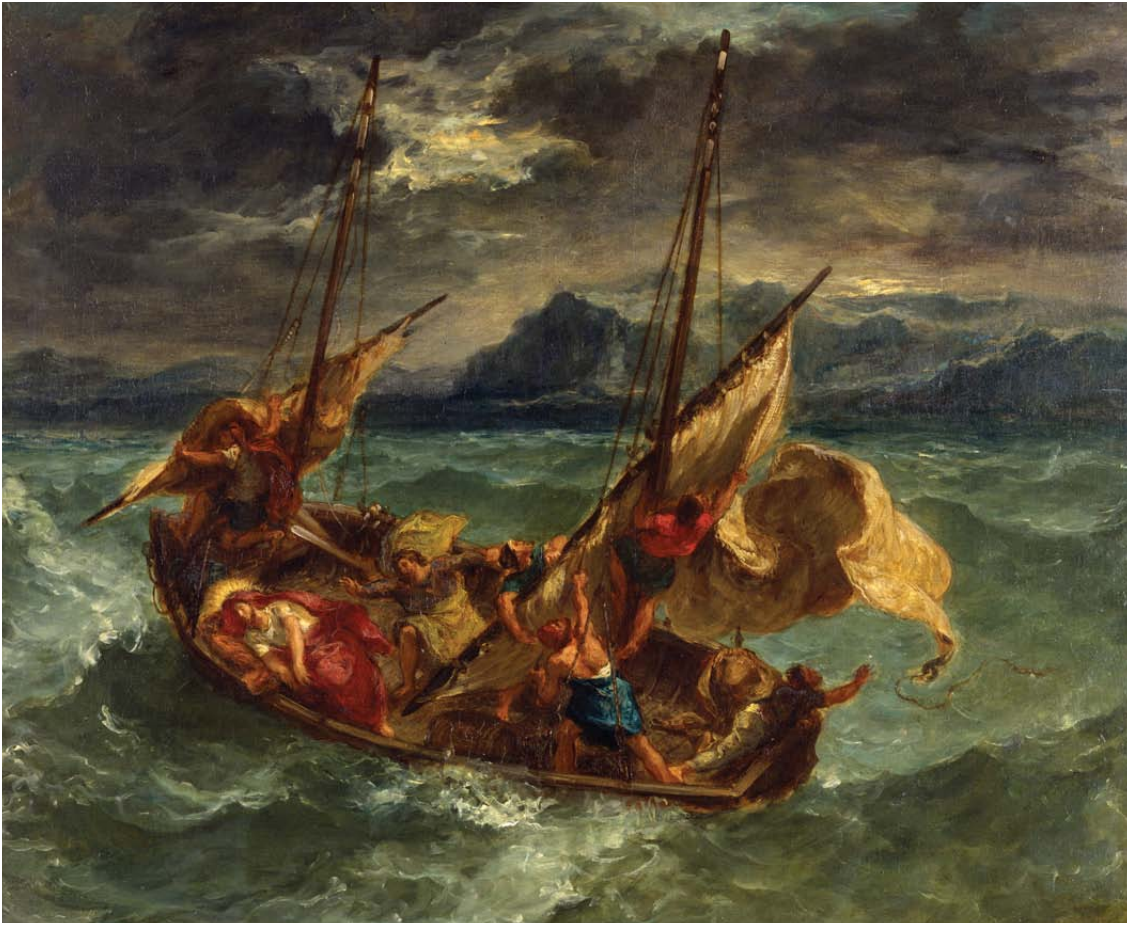
Top: Eugène Delacroix, Christ on the Sea of Galilee , 1854. Oil on canvas. The Walters Art Museum, Baltimore, Maryland (37.186, acquired by William T. Walters, 1889).